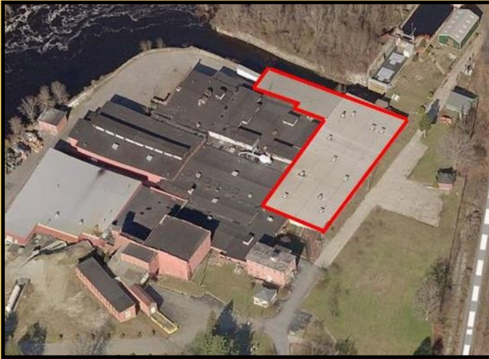
The "L" Building