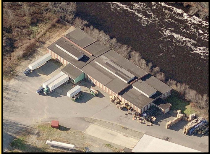
The "West" Building