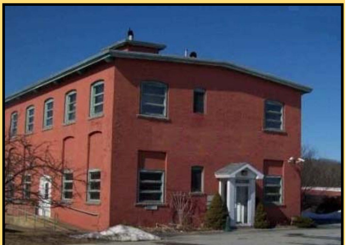
The "Train Terminal" Building