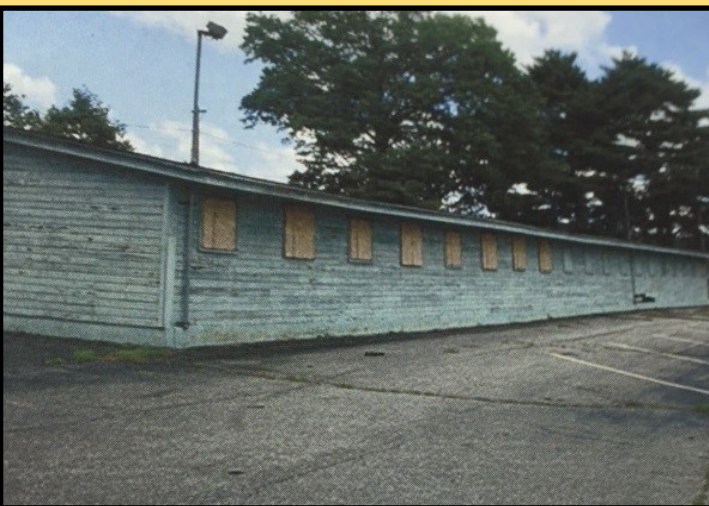
The "Green" Building