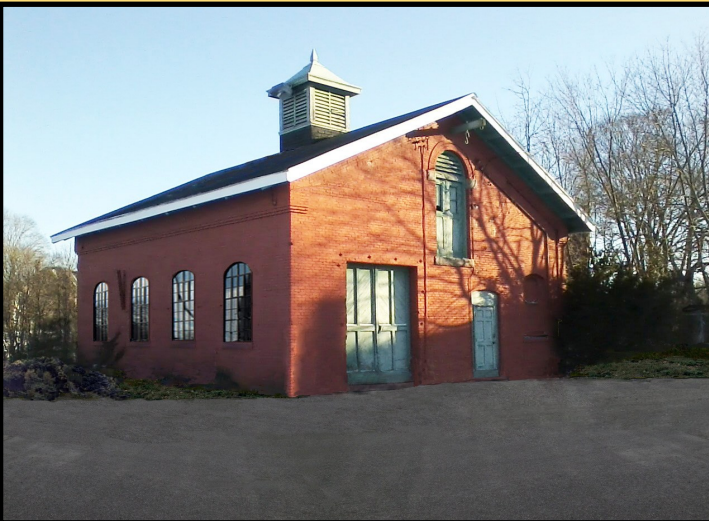
The "Stable" Building