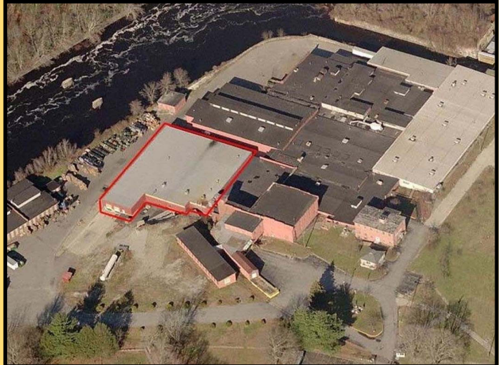
The "New" Building