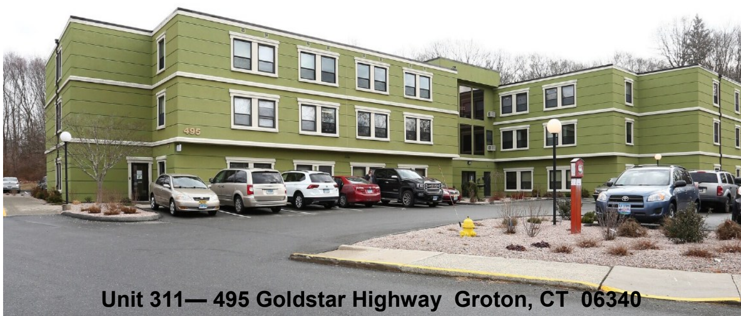
Unit 311— 495 Goldstar Highway Groton, CT 06340